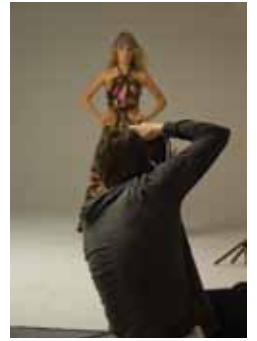
To get interesting angles, sit down or lie on the floor