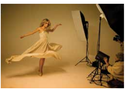
★ MOVEMENT The model was encouraged to dance and twirl around,